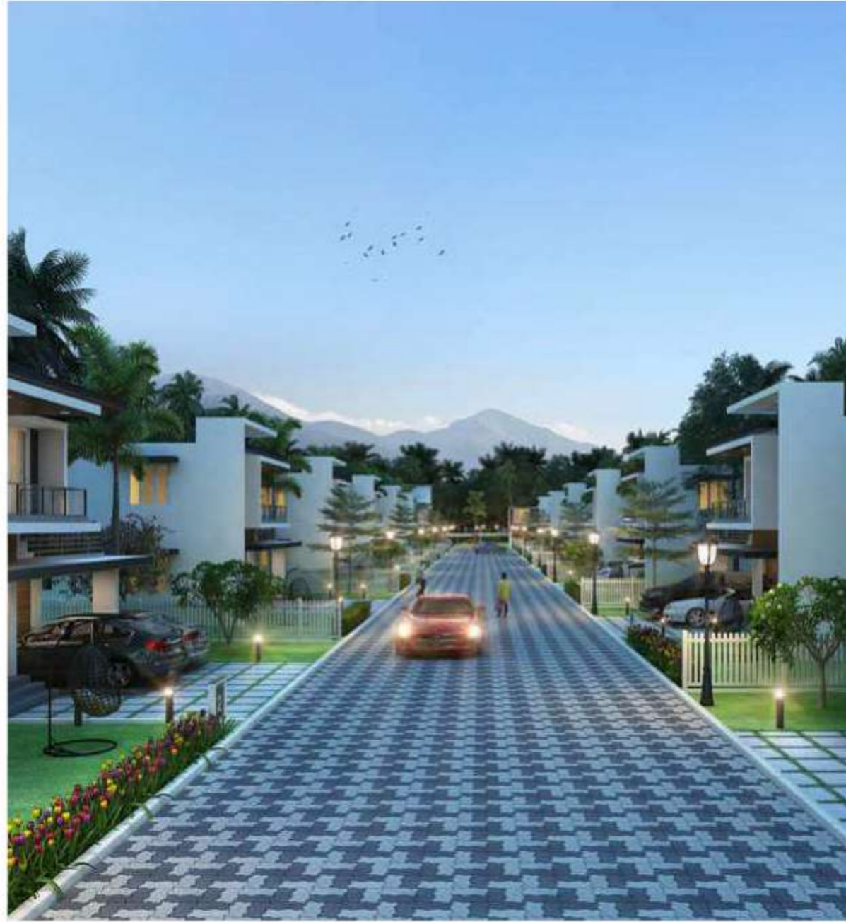
CLOUD VILLE KAKKANAD, KOCHI