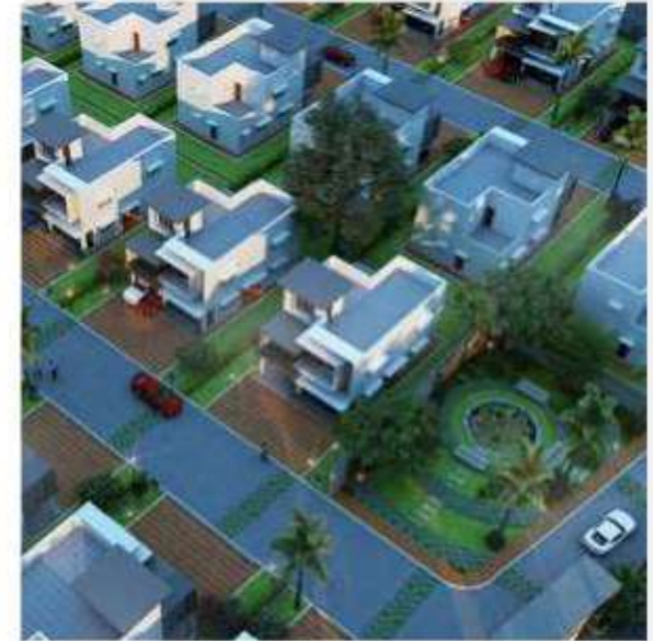
NIZA KAKKANAD, KOCHI