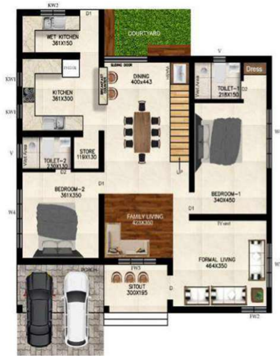
GROUND FLOOR PLAN 1417 SQ.FT