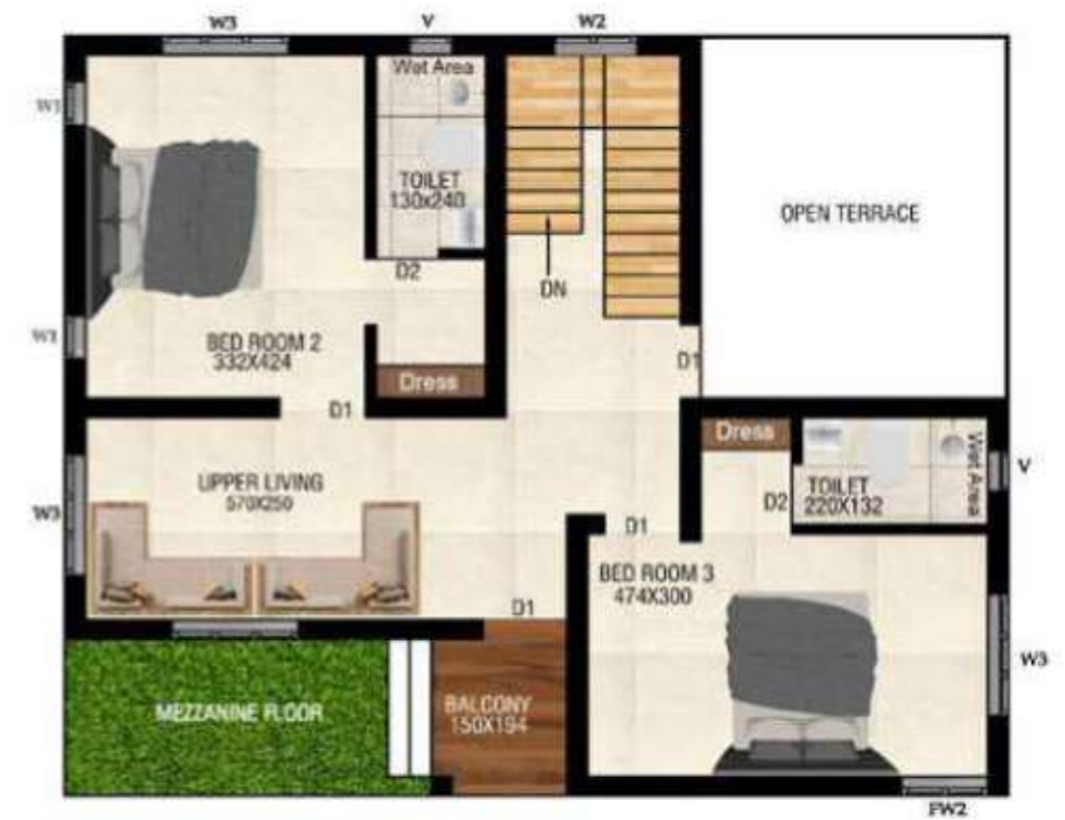
FIRST FLOOR PLAN 862.73 SQ.FT