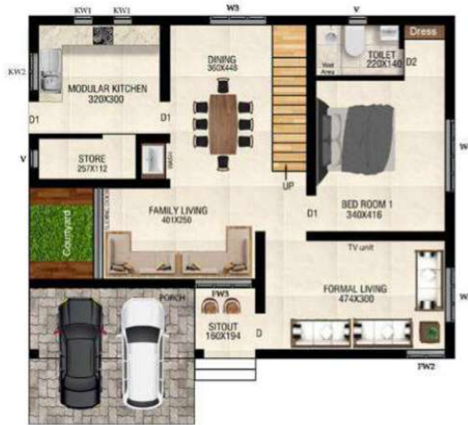
GROUND FLOOR PLAN 1128.61 SQ.FT