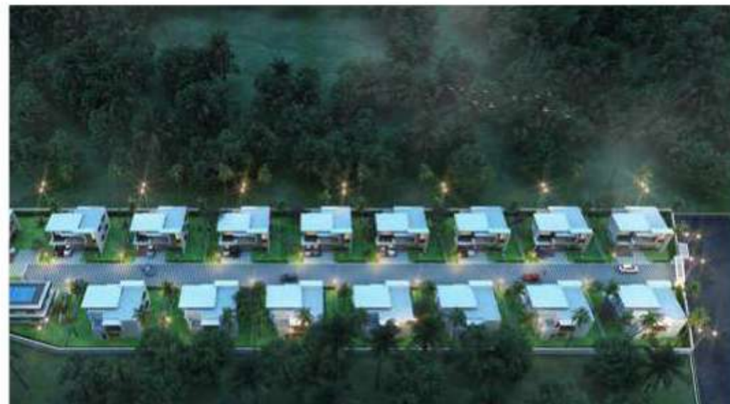
HEIGHTS PALLIKKARA, KOCHI