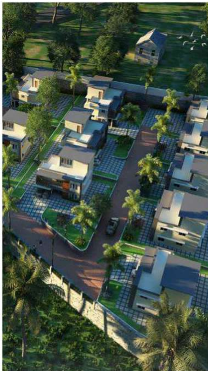
AVANI KAKKANAD, KOCHI