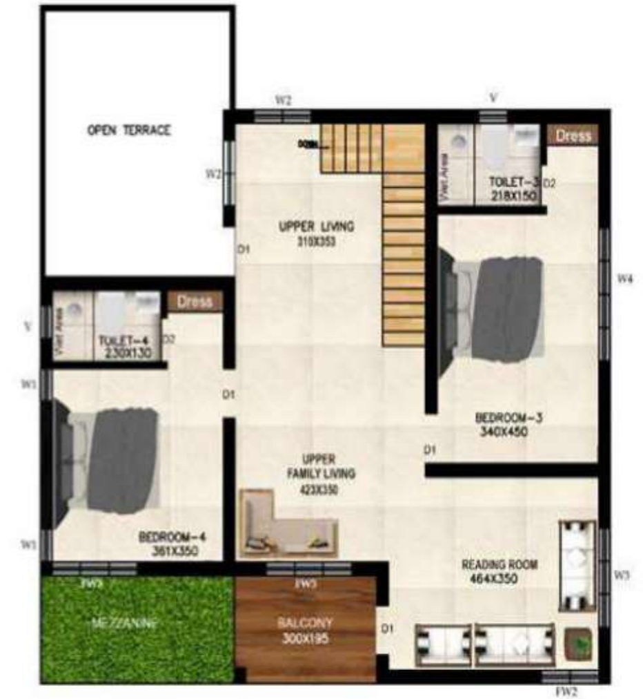
FIRST FLOOR PLAN 1124.3 SQ.FT