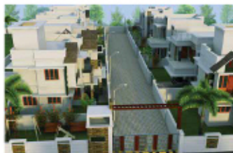
NIZA Kakkanad, Kochi