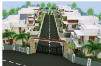
KEDARA Kakkanad, Kochi

Customization & versatility in our projects was the key to go beyond customer's expectation. Having satisfied customers made us feel contented.